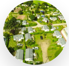
Camping & Caravanning

sp-delaison.imj.fr auvelocipede.fr cottagescroixlabbe.fr fermette-du-marais.com www.balconenbaiedesomme.com www.1866ensomme.com/ www.aubordduquai.fr www.lepuits-sale.com le21.org www.suivezlelapinblanc.com/fr/ www.booking.com/hotel/fr/l-39-odysee-peniche.fr.html www.gites.fr/gites_gite-fluvial-de-la-baie-de-somme-le-lihoury_saint-valery-sur-somme_h17730.htm