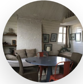
Bed & Breakfast